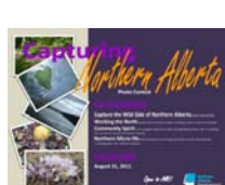
PHOTO CONTEST Check our website for information on the latest contest. Many of the photos on the front of this cover were from the 2010 Photo Contest.